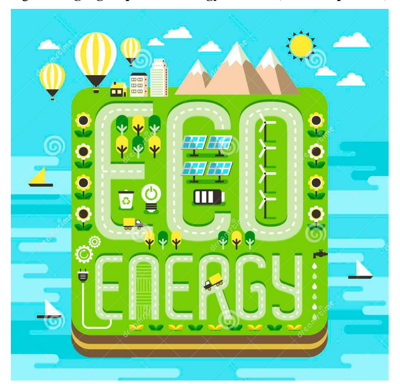
Fig. 2. Example of visualised summarisation of ecoenergy issues [10]

Consequently, an apparent task in public education is to integrate RES-related knowledge into elementary school curriculum and intensify this knowledge in secondary schools. The objectives set for the above can have a broad range including training for practicality and introduction of environmentally friendly and cost-effective technologies etc. However, it is important to note that graduating students should be aware of the essentials and main advantages of these innovations, by which a considerable contribution to the energy-conscious development of society can be made.